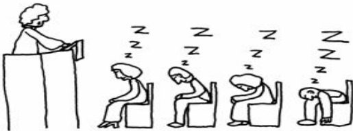
WHAT THE CHILDREN THINK HAPPENS IN THE MAIN CHURCH SERVICE