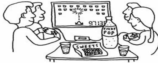
WHAT ACTUALLY HAPPENS AT SUNDAY SCHOOL